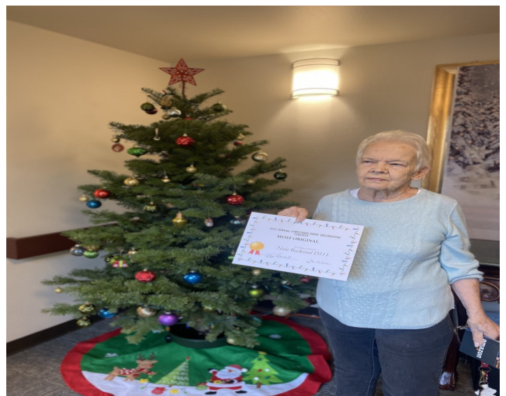
D111 - Most Original (Door)