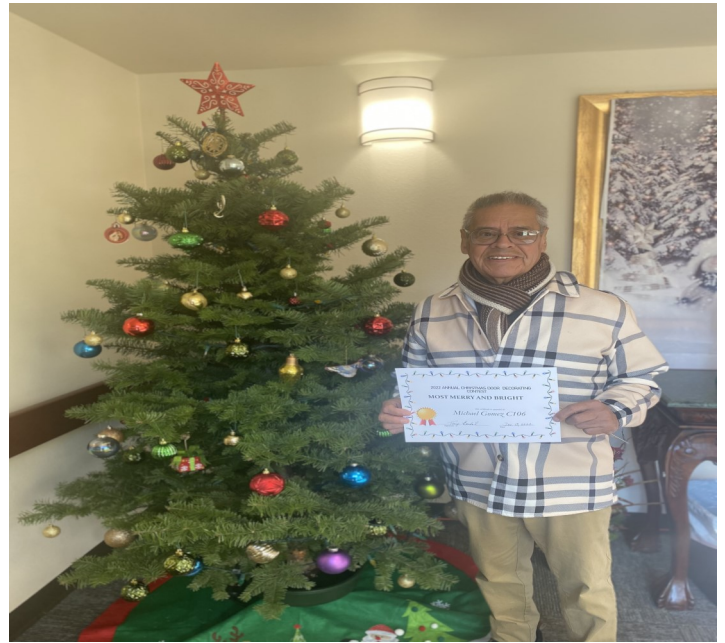
C106 - Most Merry & Bright (Door)