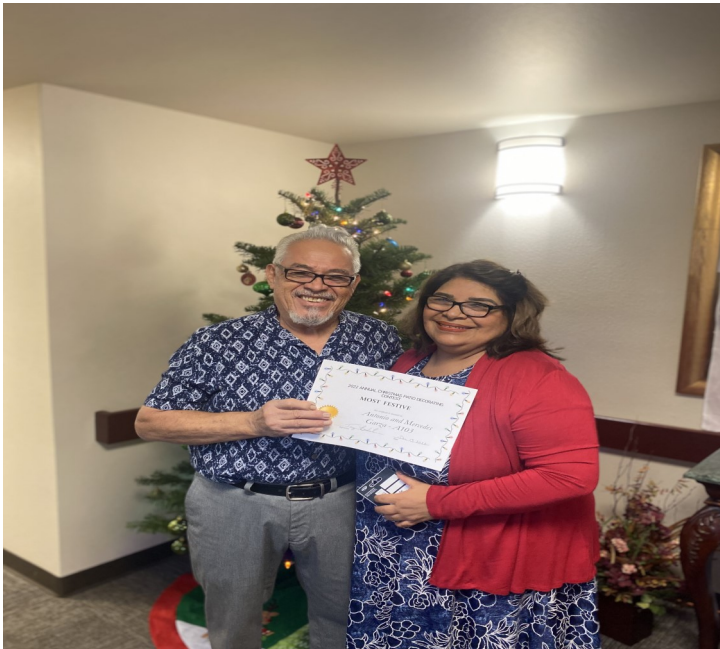
A103—Most Festive (Patio)