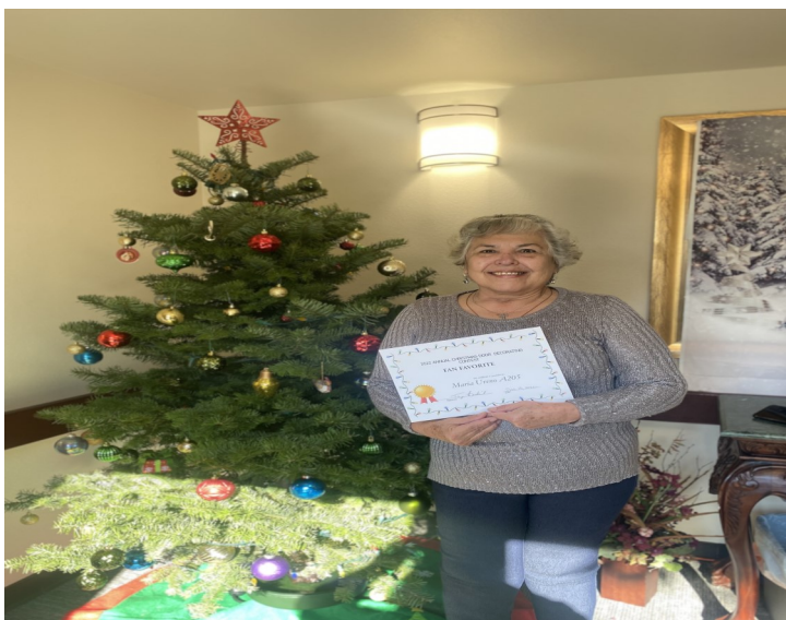
A205 - Fan Favorite (Patio)